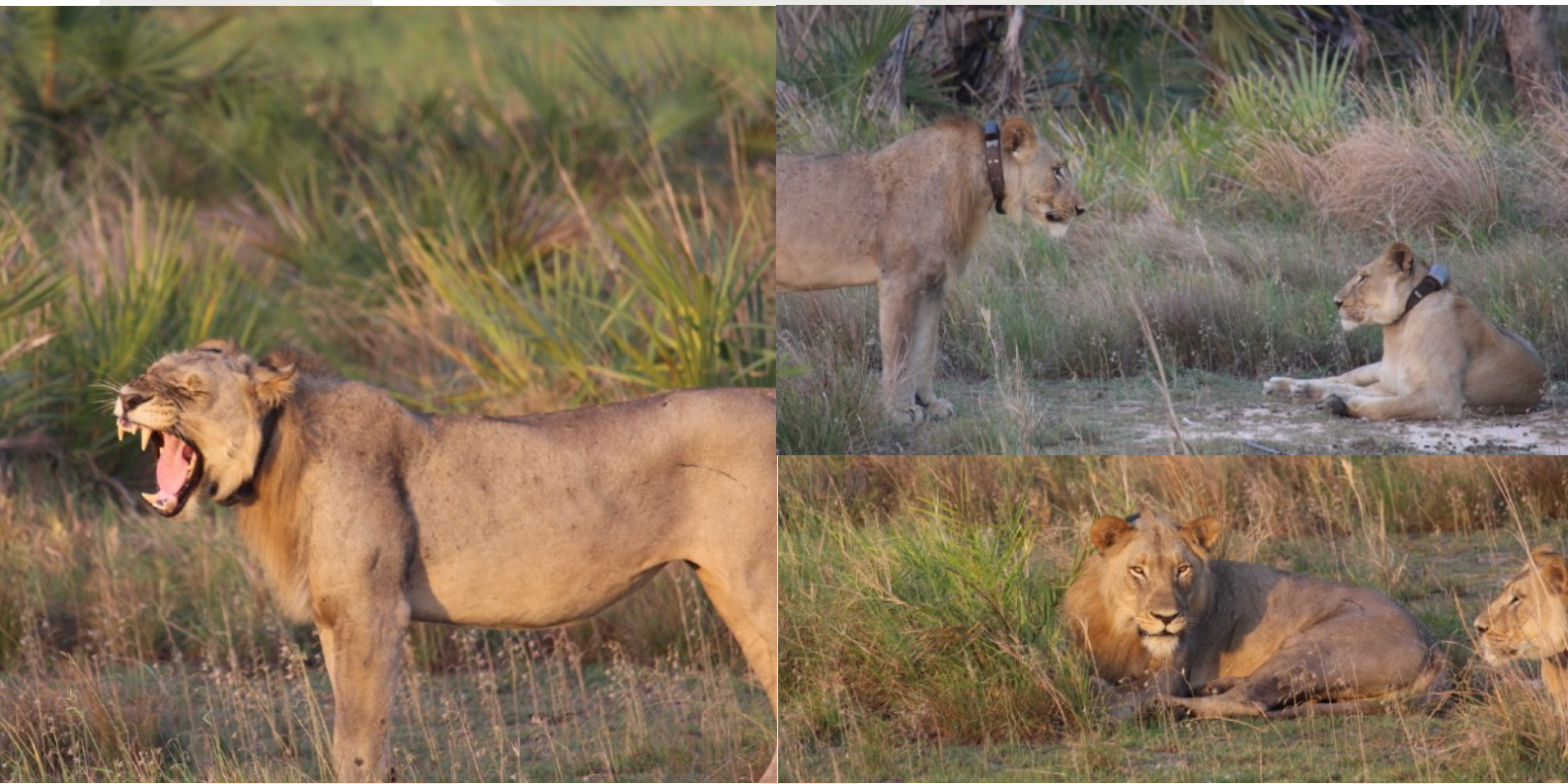
Figure 2. Mating can be quite tiring. Here are a few pictures of the Tame Pride female (TSF004) and Mkuze male (MKM001) relaxing between mating sessions.

Our research team has been tracking the mating of Bad Boy Pride's Mkuze Male (MKM001) and one of the Tame Pride's females (TSF004) along the edge of the floodplain in Coutada 11. Their GPS collar data showed that they were moving together since the 17 th of October. Upon investigation, they were found together, displaying social affection and mating regularly. From 22 October onwards, the two were still moving together, but did not mate with the same intensity as during the first 5-6 days.