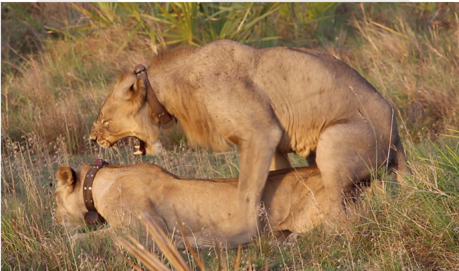
Figure 3. Mkuze Male about to bite the neck of the Tame Pride female during mating.

The courtship usually starts with enticement from either the male or the female. When mating, the male will typically bite the female at the back of the neck and/or emit a sound known as a 'yawl', indicating copulation. Mating lasts on average 15-17 minutes, which means lions can mate more than 250 times during this period. They often continue mating for 1 - 4 days after the primary oestrous period. This is called secondary oestrus and is evident from the male being less possessive over the female and mating for shorter periods with longer intervals between mating. After a gestation period of about 110 days, females give birth to an average of 2-3 cubs 2,3 .