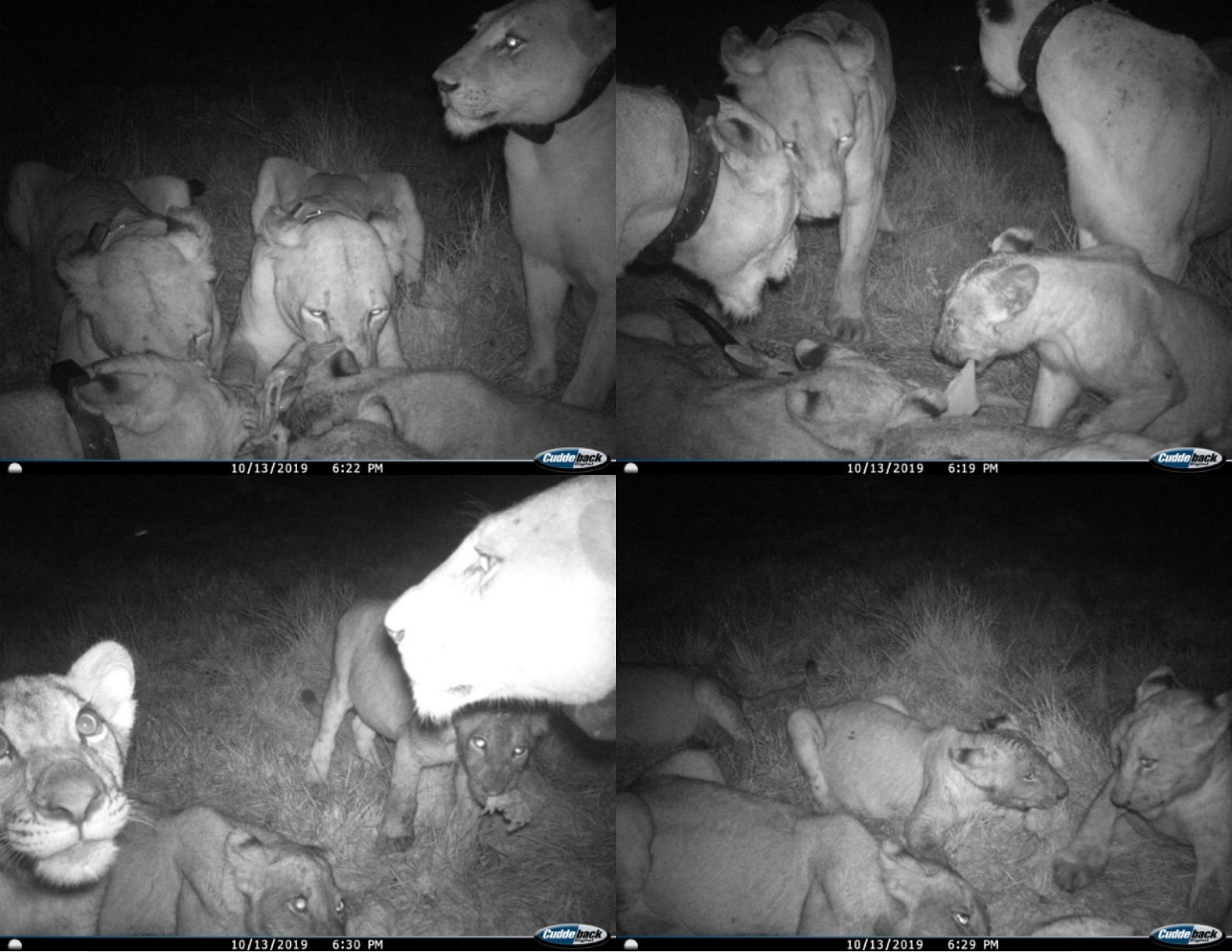
Figure 1. Camera trap photos of the Mak Pride on a reedbuck kill in Coutada 10.