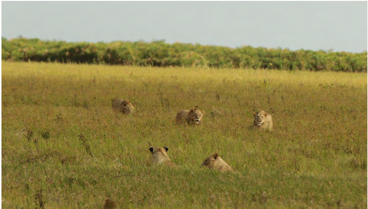
The Boys are Back: the C11 flagship-pride reuniting on the plain

Lioness 2774 is the only cat that never leaves Coutada 10, though she often associates with lionesses 2778 and 2782 who spend the majority of their time in Coutada 11 floodplain. Lions 2780 and 2785 ( representing 3 males and 2 females ) have colonised the central area of the Coutada 11. Lioness 2776 and lion 2786 ( and their sister ) have taken the area to the north east, near where Nhazua 2784 has since settled. Lionesses 2777 and 2775 ( faulty collar ) are essentially our first swamp cats that have used the papyrus to great effect for both hunting and shade. Lioness 2779 is a loner, but she is always in fantastic condition and clearly doing well for herself.